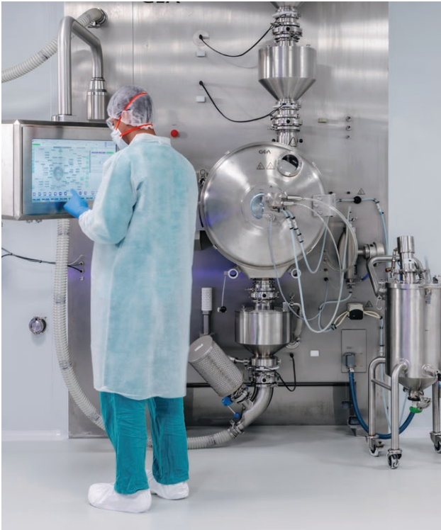
Hovione has installed state-of-the-art Continuous Tableting equipment